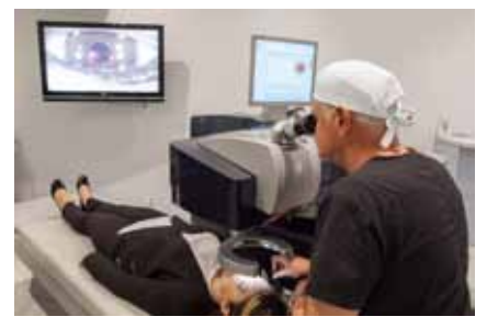
Figure 2. The WaveLight EX500 excimer laser.

Figure 1. Top left shows right eye topography following a grossly decentred PRK for high myopia (original refraction unknown). BCVA was 6/15. Bottom left is final result with 6/7.5 BCVA. Right is the difference map showing both steepening of the flat area and flattening of the steep area achieved under TG control.